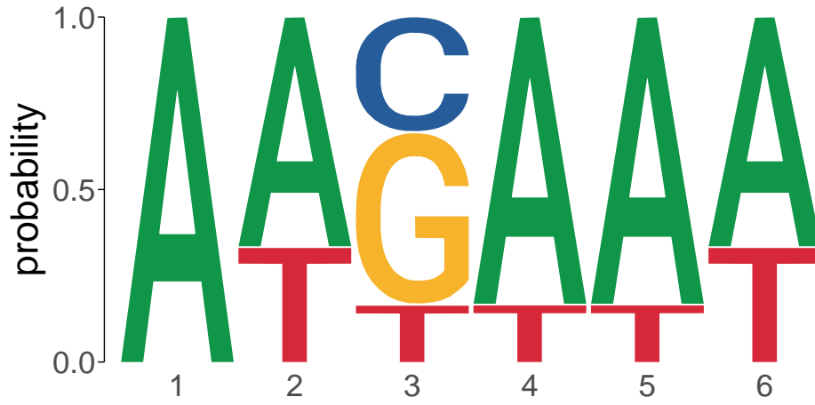
Figure 1: Sequence logo of a Position Probability Matrix